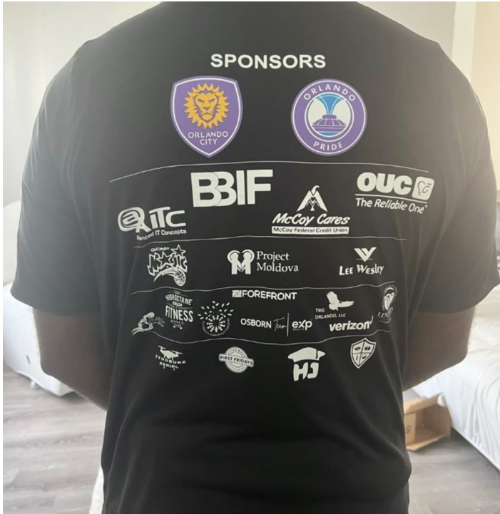
SAMPLE T-SHIRT DESIGN