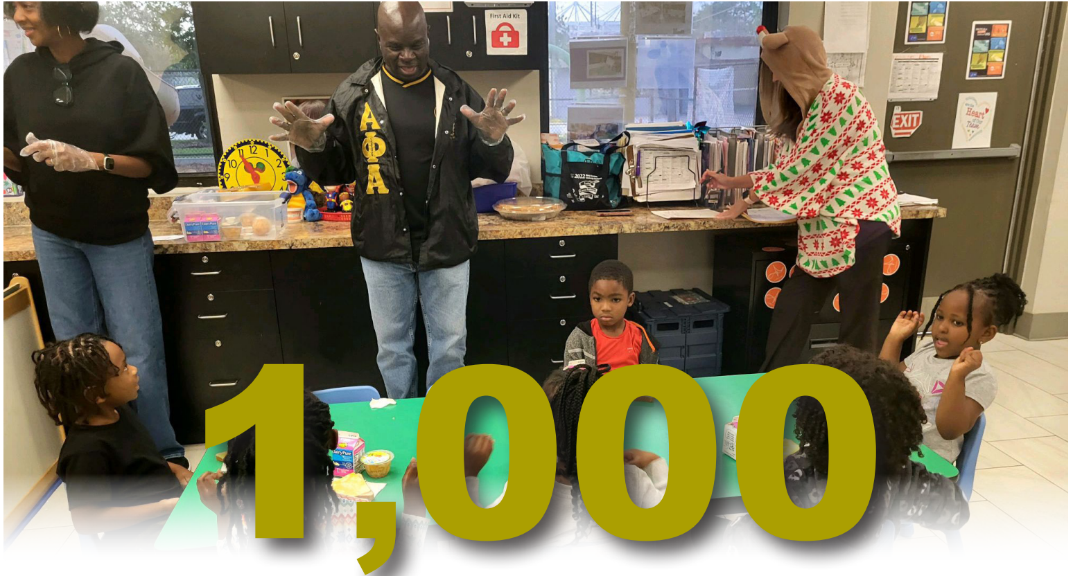
Books And Large Quantities Of Supplies Donated To Four Orange County Head Start Centers