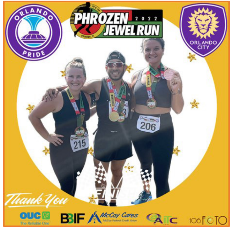
VIRTUAL PHOTO BOOTH FRAME