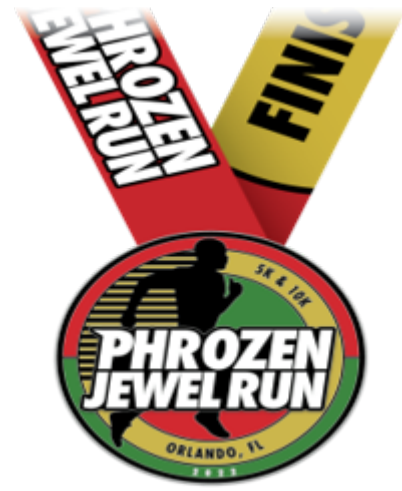
SAMPLE MEDAL RIBBON