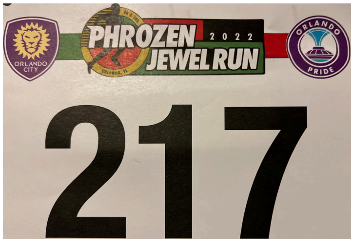
SAMPLE RUNNER'S BIB